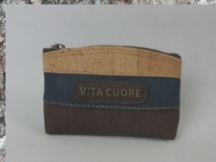
Stripes Holder Coins Ref m 308-Q-Br-Nat-B