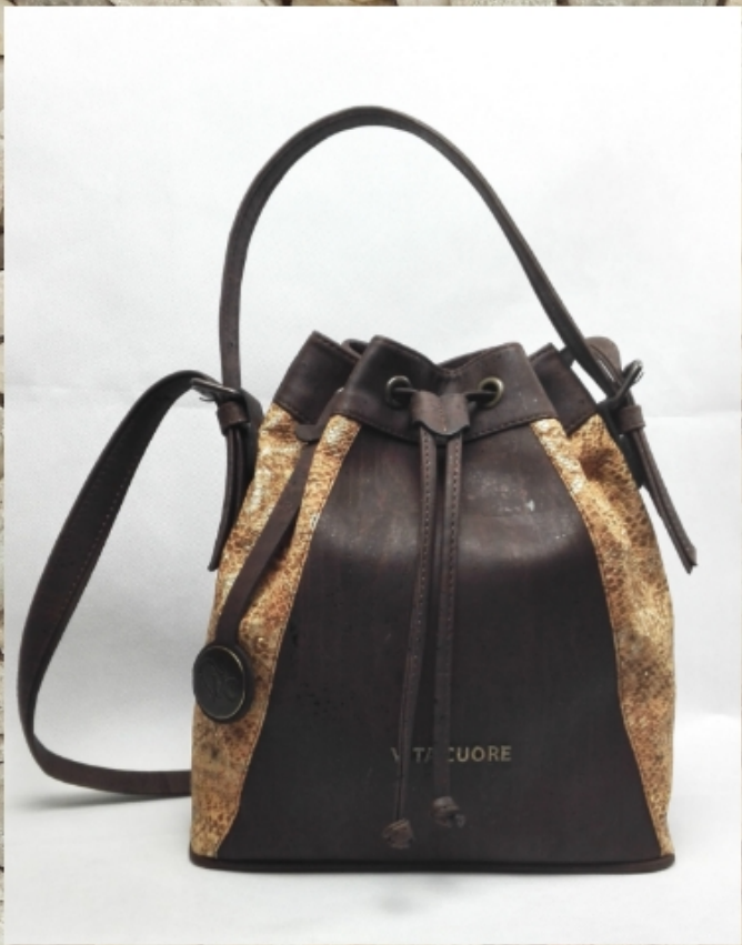
Younger Snake Bag Ref a 259-Q-Br-Sk