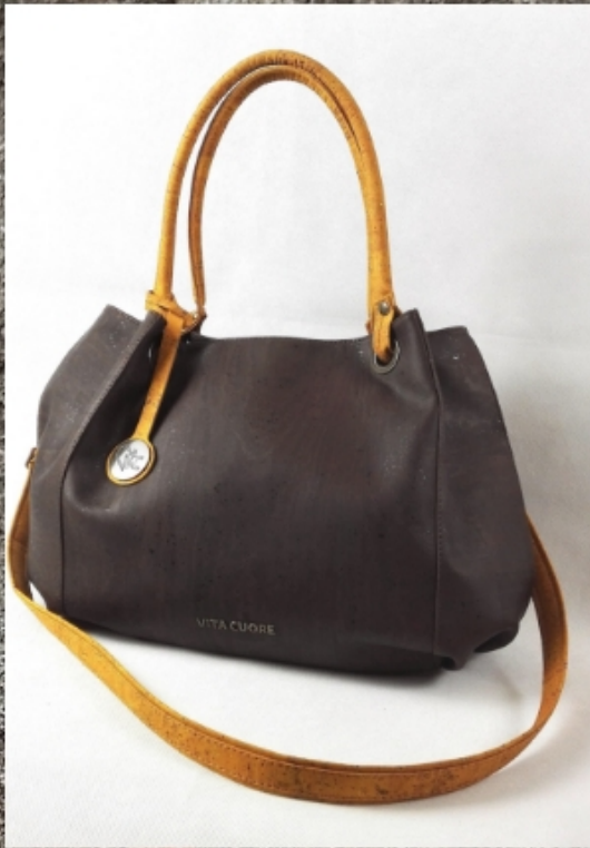
Wheat Bag Ref ™ 266-Q-Br-Y