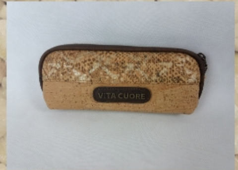
Snake's Pencil Case Ref m 311-Q-Nat-Sk