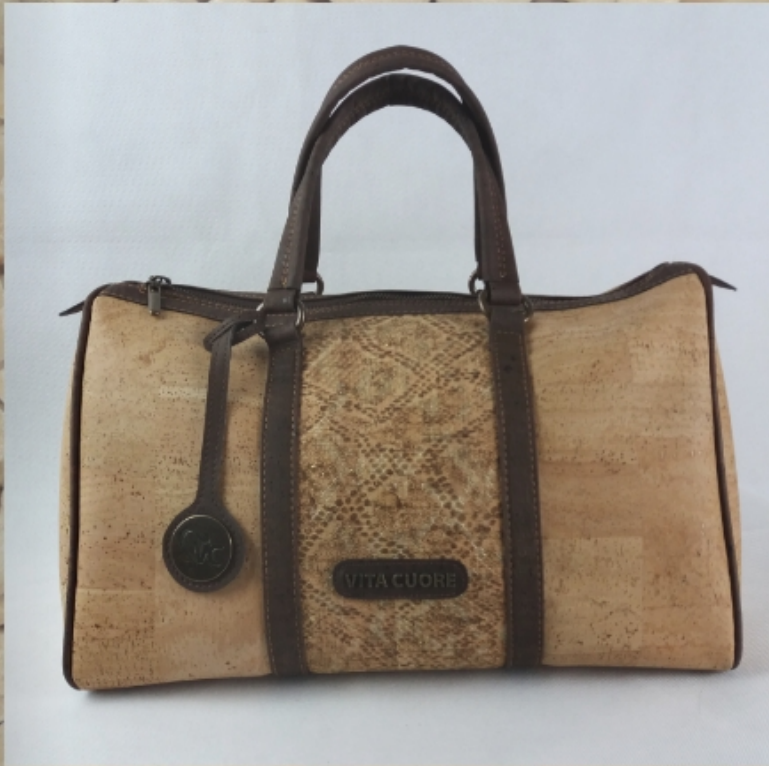
Snake's Pouch Ref m 255-Q-Nat-Sk