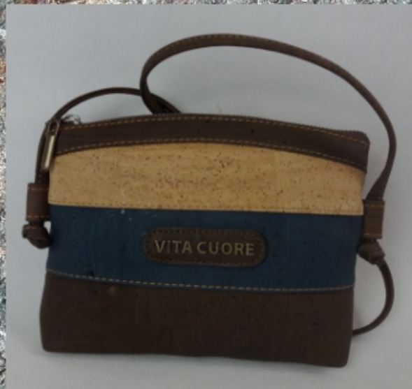
Stripes Bag Ref m 252-Q-B