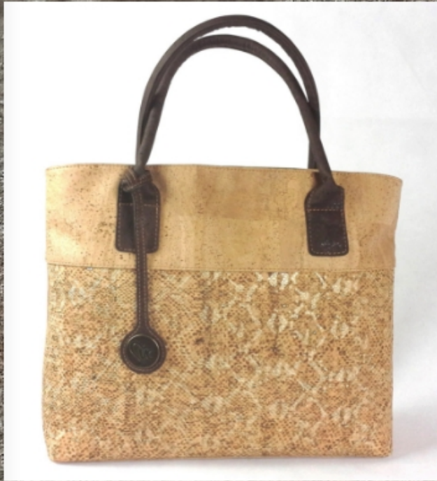
Big Snake Bag Ref a 261-Q-Nat-Sk