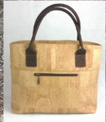
Vita Cuore Collection