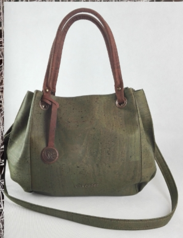
Moss Bag Ref a 266-Q-Gr-Br